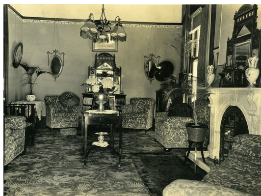
The drawing room at Villa Maria , Woniora Road, Hurstville, c. 1920.