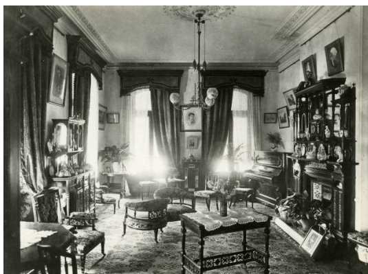
The drawing room at Dappeto , Wollongong Road Arncliffe, in 1885.

The term lost favour after WW1 when it was often referred to as the 'death room', as it became the room where a deceased person would be laid out for viewing by friends and relatives for the final time. By the 1920s, we had coined a new term, called the Living Room, which was located as far away as possible from the 'death room' and hence, we generally find the Living Room situated at the back of a house.