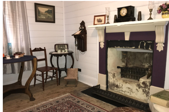
Simple and clean interiors