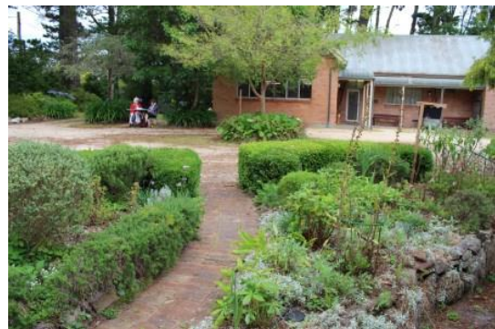
Volunteers in front of the admin building