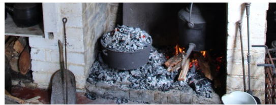
The fire inside where they make scones!