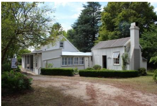
The approach to the house