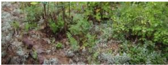
The kitchen with it's lovely kitchen garden