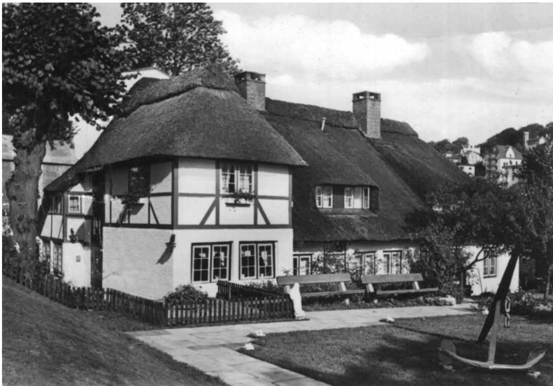
This photo is related to the following two articles