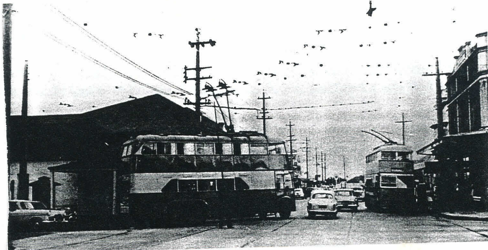
70. TROLLEY BUS 'DERAILED', 1959. Not infrequently the 'trolleys' became disengaged from their overhead wires and the conductor had to reconnect them using a long hooked pole kept in the side of the bus. The 'derailed'

trams. The maintenance being carried out here was at the tram shed at Sandringham, just prior to the trolley buses superseding the steam tram.