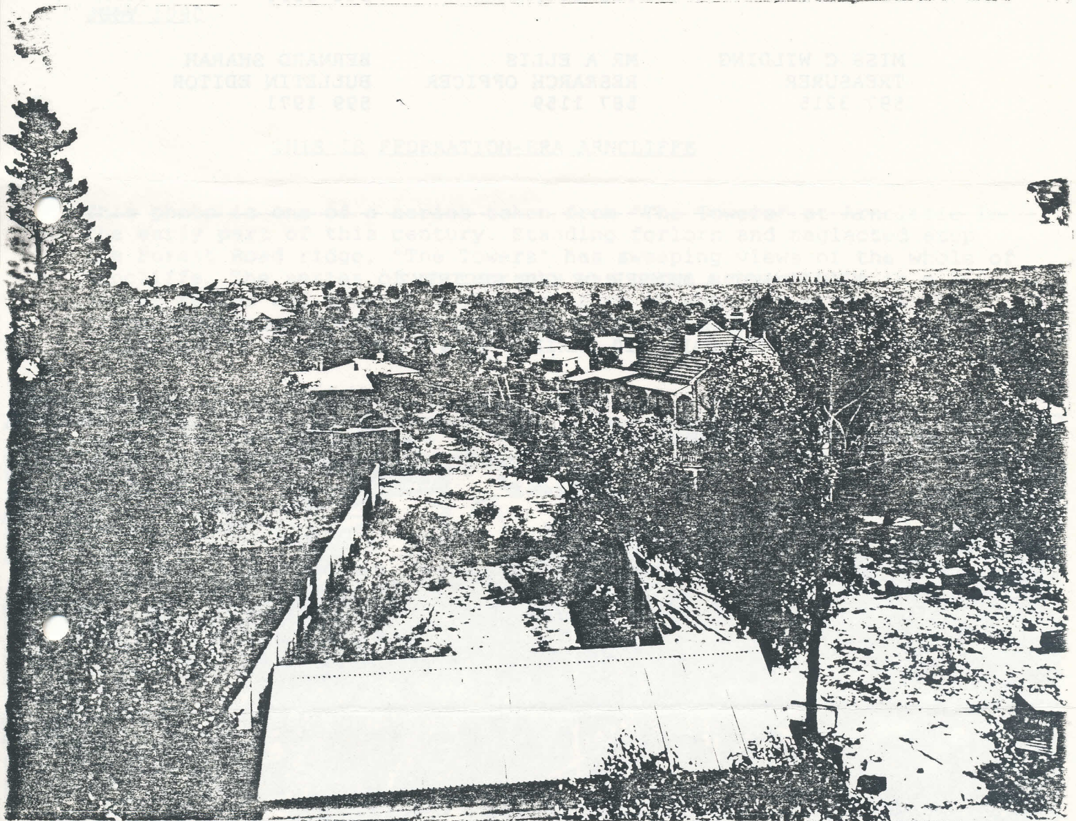
View of what is now Esdaile Place from "The Towers" 105 Forest Rd Arncliffe.